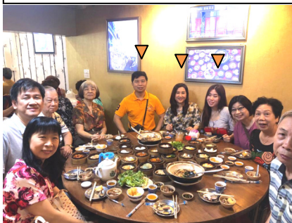
My Cousin & her father (my mum's 2 nd brother)